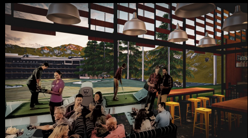
Golf Bar View